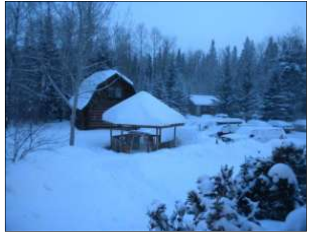
Views from the main lodge deck, early Saturday morning on March 12 th .