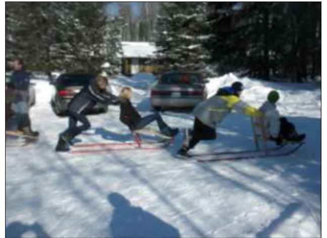
Start of doubles races.