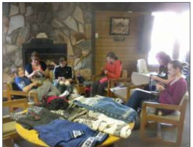
Norwegian knitting class.