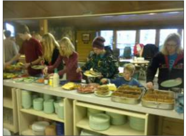
and the food line. Feet up, by the fireplace.