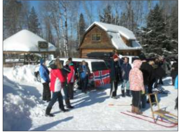
Anna organized the spark races.

The spark races were a popular event with excellent participation helped by Anna's enthusiasm and organizing skill. The course went some 200 ft up a gentle slope, and then returned downhill to the start location following a different lane, accompanied by loud cheering and laughter. We began the event by singing Ja vi elsker dette landet . There were doubles events with one kicker and one rider on each spark , singles events, and finally the relays with everyone present lined up for the hand-offs when each of the three sparks completed each lap. There were approximately nine relay laps for the twenty-seven children and adults participating. Still-pictures do not do justice to this event. Only video captured the sound and the action. Nevertheless, some still pictures of racing and hand-offs follow.