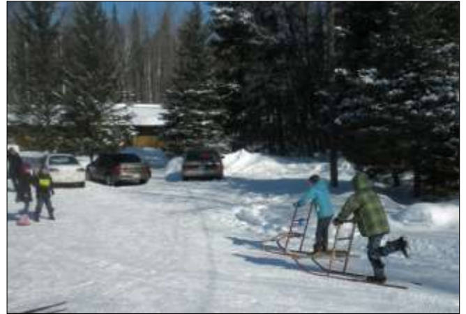
Relays, right: coming in full speed for the hand-off to the next racer.