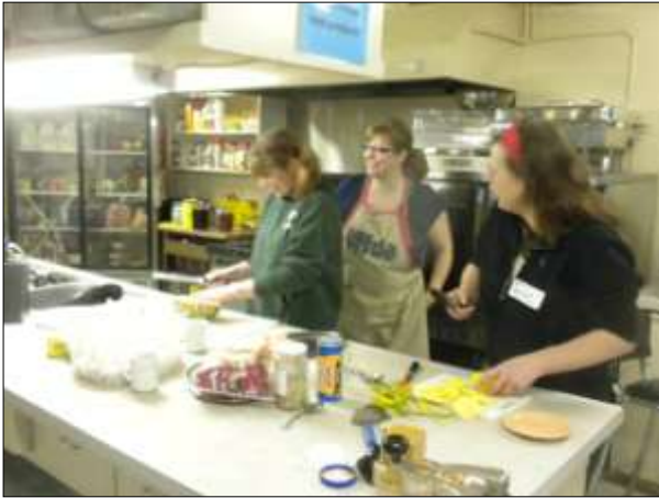
Kitchen volunteer team, Lunch time.