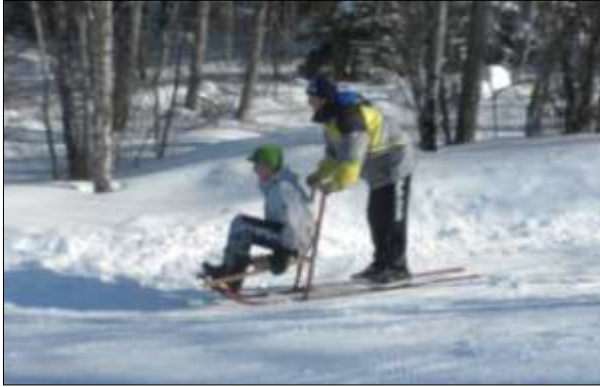
Doubles gliding to the finish.