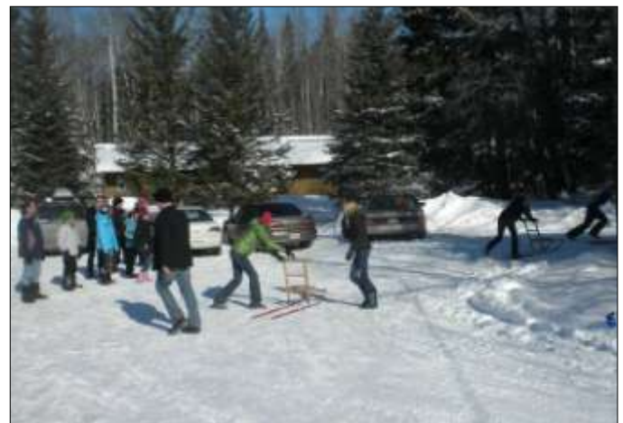
Right; two have already gone off ahead.